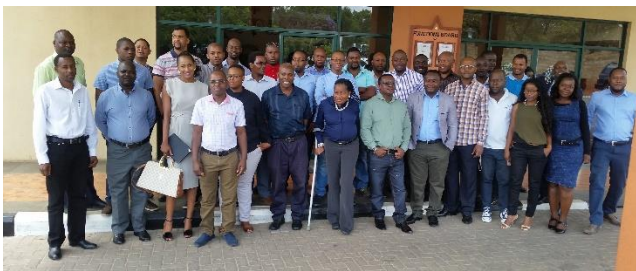
Some SAPP Traders and Controllers at the Forum in Lusaka, Zambia

The 13 th SAPP Energy Traders and System Controllers Forum was held from 19 to 20 October 2016 in Lusaka, Zambia. Traders and Controllers shared various experiences and challenges in electricity trading and power system control in SAPP. They also had an opportunity to interact in person thereby providing an opportunity for team-building. They also had an opportunity to familiarize with the Zambia power network at the ZESCO National Control Centre in Lusaka, Zambia.