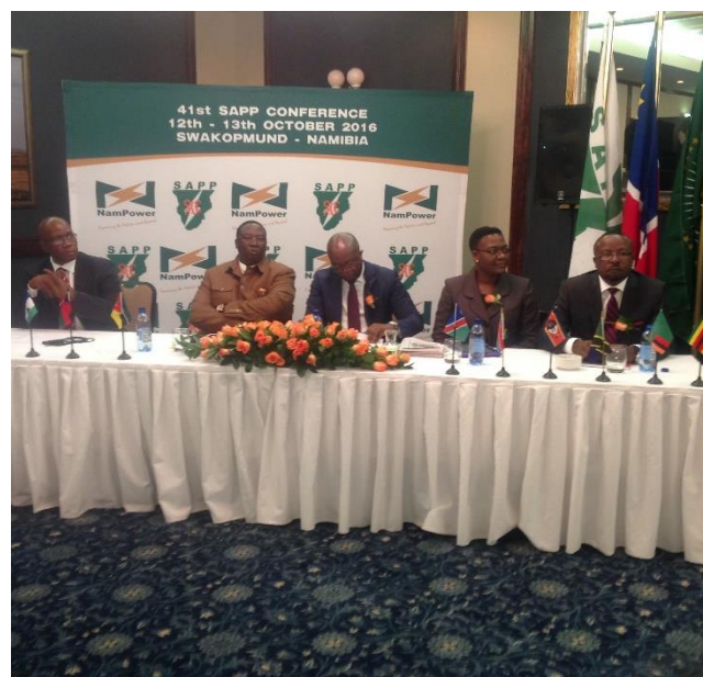
Guest of Honour Honourable Minister of Mines and Energy, Hon. Obeth Mbuipaha Kandjoze During the Official Opening

disturbances, environmental issues including the impact of climate change to generation capacity.