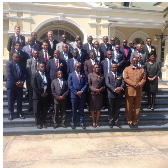
Delegates to the 41 st SAPP EXCO Meetings pose for a photo with Guest of Honour Minister of Mines and Energy

The meetings discussed among other issues, the demand and supply situation in the SADC region, status of implementation of generation and transmission projects, implementation of the SAPP Market trading system and performance of the competitive market, operational issues including mitigatory measures to reduce system