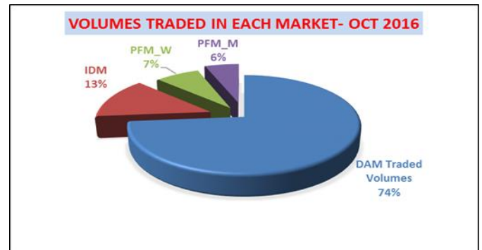
Traded Volumes in MWh in DAM, IDM, FPM-W and FPM-M for the month of October 2016.

Trading in the market was higher during the month of October 2016 when compared to September 2016. Total traded volumes on the Day Ahead Market (DAM), intra-day market (IDM), Forward Physical Market Monthly (FPM-M) and Forward Physical Market Weekly (FPM-W) increased by 20% to 131,520.7 MWh in the month of October 2016, from the September figure of 109,612.3 MWh. Below is the overview of volumes traded in DAM, IDM, FPM-M and FPM-W for the month of October 2016.