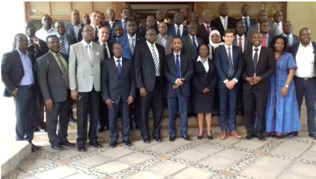
Some delegates at the Nairobi PIDA Workshop organised by the AU Commission

this online portal. The output of this workshop will also feed into the reports for the PIDA week scheduled for November 2016 in Cote d'Ivoire.