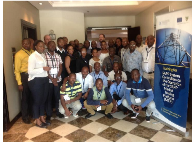
SAPP System Controllers attending the Training on the operation of the SAPP Market Trading Platform (SAPP-MTP)

The workshop was attended by two system controllers from all the SAPP members.