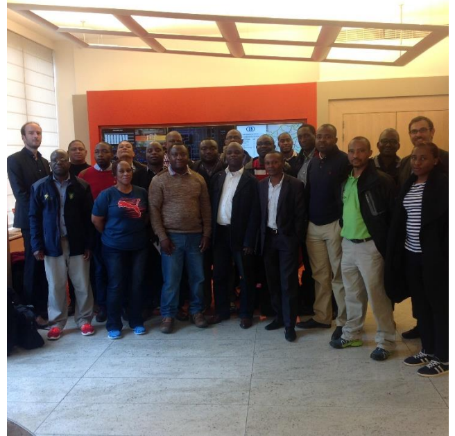
MSC members pose for a photo at CORESO offices in Brussels, Belgium