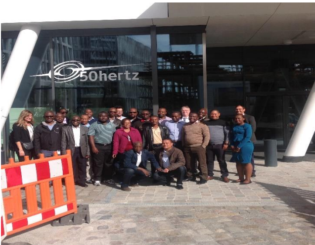
MSC members pose for a photo at 50 Hertz offices in Berlin, Germany

The study tour covered a number of areas that include EU system balancing framework, including balancing responsibility, the available balancing markets, balancing with increased renewable energy penetration, TSO coordination mechanisms and online system operations, the proposed Grid Control Cooperation and system reserves (GCC), cross border trading, transmission congestion management mechanisms such as flow based and capacity auctions, TSO roles etc. A total of 21 participants attended from 11 SADC countries.