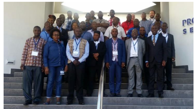
Some SAPP System Controllers at the Training Workshop in Cape Town

platform (SAPP-MTP) was necessary. The SAPP thus secured funding from the European Union (EU) for delivery of a specialized training workshop for SAPP System Controllers on electricity markets. The training workshop was held from 12 to 14 September 2016 in Cape Town, Republic of South Africa. In this first stream, 2 System Controllers from each SAPP member utility were trained. The second stream will be held in October 2016.