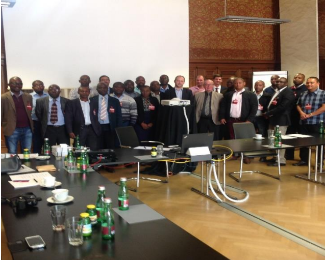
MSC members pose for a photo at EXXA offices in Vienna, Austria

The study tour covered a number of areas that include EU system balancing framework, including balancing responsibility, the available balancing markets, balancing with increased renewable energy penetration, TSO coordination mechanisms and online system operations, the proposed Grid Control Cooperation and system reserves (GCC), cross border trading, transmission congestion management mechanisms such as flow based and capacity auctions, TSO roles etc. A total of 21 participants attended from 11 SADC countries.