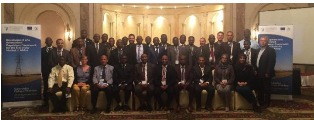
Delegates at the Cairo Regulatory Framework Workshop organised by the AU Commission

From 27 to 29 September 2016 the African Union Commission held a workshop on continental regulatory framework for energy market in Cairo, Egypt. The main objective of this workshop was to validate the strategy document and action plans of the final report on harmonised regulatory framework in the African energy sector, focusing on the electricity sector. SAPP, other power pools, national and regional energy regulators, regional economic communities, and other key stakeholders in the energy sector participated in the workshop. The workshop priority areas and action items for intervention to enhance harmonisation of regulatory frameworks at the regional and continental levels. The southern African region and SAPP in particular were hailed for having made great progress in harmonisation and implementation of regional energy markets.