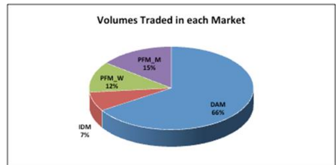
Traded Volumes in MWh in DAM, IDM, FPM-W and FPM-M for the month of July 2016.

market (DAM), intra-day market (IDM), Forward Physical Market Monthly (FPM-M) and Forward Physical Market Weekly (FPM-W) increased by 54.8% in the month of July 2016. Trade in July 2016 was at 47,792.1 MWh as compared to 30,877.50 MWh traded in the month of June 2016. Below is the overview of volumes traded in DAM, IDM, FPM-M and FPM-W for the month of June 2016.