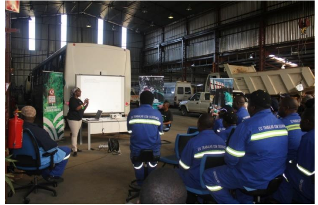
HCB Environmental staff delivering a lecture during the World Environment Day