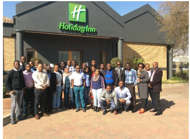
Delegates who attended SAPP-MTP Certification course in Johannesburg