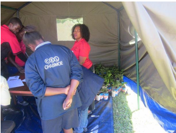
Compliance and Quality Department conducting awareness during the World Environment Week

CEC in Zambia, held celebrations on Tuesday 7th June 2016. The activities included a match past, speeches, entertainment and exhibition by the participating companies. CEC took part in the Match past and exhibited the biodiesel, a renewable product produced at CEC.