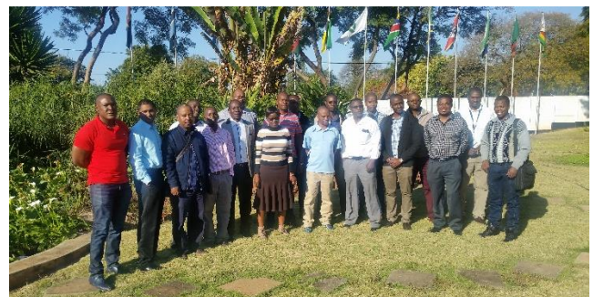
Delegates at the SAPP Protection Systems and Emergency Plans Meeting in Harare

From 20 to 21 July 2016 power system protection and operations engineers from the following SAPP power utilities met at the SAPP Coordination Centre in Harare: BPC, CEC, EDM, Eskom, SEC, ZESA and ZESCO. They shared information on protection systems on tie lines and on power system emergency preparedness. They evaluated performance of protection schemes and underfrequency load shedding schemes in SAPP. They agreed on activities necessary for coordination protection schemes and emergency plans in SAPP.