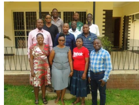
SAPP PAU and SEC Staff at SAPP CC Offices in Harare, Zimbabwe

The visit also included some Members of Swaziland Electricity Company (SEC) who got presentations on SAPP structures with SAPP Operations.