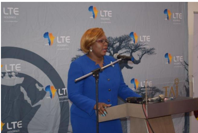
Honourable Minister of Energy and Water Development of the Republic of Zambia, Hon. Dora Siliya , MP, addressing the delegates