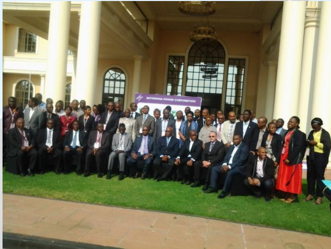
Officials to the 45 th SAPP Meetings pose for a photo during official opening

The Minister informed the Management Committee that the SADC Summit approved the Revised Regional Indicative Strategy Development Plan (RISDP) and Implementation Framework for the period from 2015 to 2020 and the SADC Industrialization Strategy Roadmap and Action Plan at their Extra-Ordinary meeting of April 2015; and that these strategic documents identify energy as one of the main drivers of economic growth.