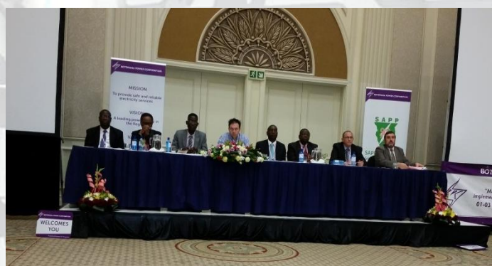
Senior Officials and Sub-Committee Chairpersons during the Plenary Session of the 45 th SAPP Meetings in Gaborone, Botswana