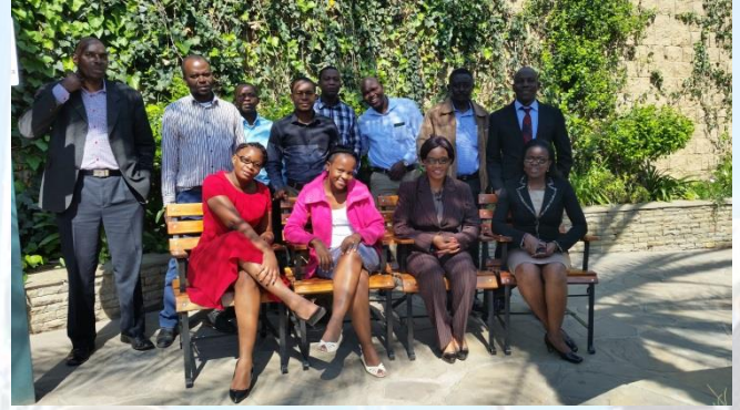
Some members of the SAPP QOSWG at the meeting in Windhoek, Namibia

The SAPP Quality of Supply Working Group (QOSWG) met in Windhoek, Namibia. The Working Group reviewed progress of the project of installing power quality meters on all SAPP interconnectors. It was noted that most power utilities have installed the meters. The Working Group then resolved to start sharing power quality data from 1 October 2015. Further, the working group started developing a guide for mitigating power quality problems in SAPP. The guide will be finalised by end of December 2015.