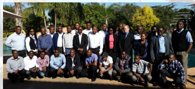
SAPP QOS Workshop Participants

carrying out necessary intervention measures to ensure that customers are supplied with power of good quality. The workshop facilitators came from Europe but regional experts from the Energy Regulatory Board of Zambia (ERB) and the Regional Energy Regulatory Association (RERA) also made presentations at the workshop. Participants also carried out field visits to QOS facilities of the Zambian national power utility, ZESCO.