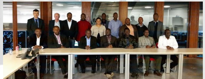
OSC Members at the National Control Centre of Belgium in Brussels

From 22 to 26 June 2015 the SAPP Operating Sub-Committee (OSC) participated in a study visit of key Transmission System Operators (TSOs) in Europe and the headquarters of the European Network for Transmission System Operators for Electricity (ENTSO-E). The objective of the visit was to share knowledge on best practices in operation of interconnected power systems. The OSC learnt a lot from the visit, including administration of operation codes, what to do when operating a power system with considerable amount of renewable energy sources, how to share information among TSOs, and requirements for training and certification of power system controllers.