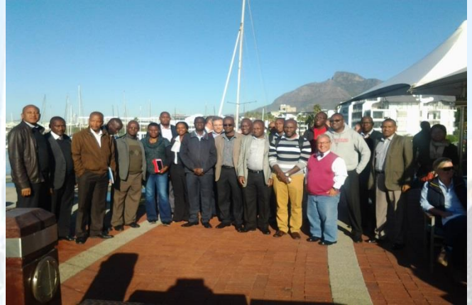
Participants at the IPP Framework Workshop in Cape Town, RSA