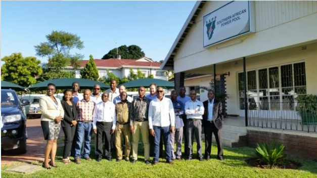
MSC Members pose for a photo during the meetings at SAPP CC Offices in Harare

issues related to the development of the SAPP Market Trading Platform (SAPP-MTP) that include progress regarding development of the intraday, month and week ahead trading platforms, SAPP Market rules, proposals to incorporate bilateral wheeling and energy imbalance settlement calculations in the SAPP-MTP and revision of the SAPP transmission capacity allocation criteria. It was noted that target delivery date for the remaining trading platforms is August 2015.