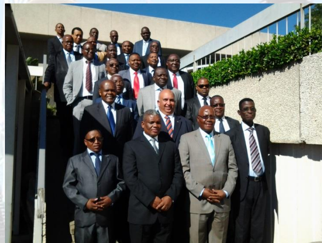
Members of the SAPP Executive Committee during the meeting in RSA