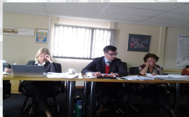
The delegation of the Government of Norway and Sida during the AGM in Harare.

The 2015 SAPP-Sida-Government of Norway AGM was held on 21 April 2015 at SAPP CC Offices in Harare, Zimbabwe. The meeting discussed the power supply situation in the region, the progress report on the programme activities. Government of Norway and Sida are funding a number of activities that are meant to support the development and operations of the SAPP competitive market including the development of a new trading platform for SAPP.