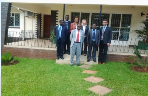
SAPP-CC members and the Government of Norway and Sida members pose for a photo during the AGM in Harare.