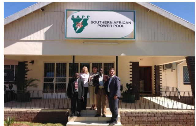
Representatives from Government of Norway, Sida and NORAD pose for a photo with SAPP CC team during the AGM on 14 June 2014

The meeting also discussed the planned activities for the period 2014 to December 2015.